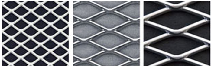
SQUARELINE standard SQUARELINE medium SQUARELINE ultra

MATERIAL: Expanded perforated metal with melamine foam backing.