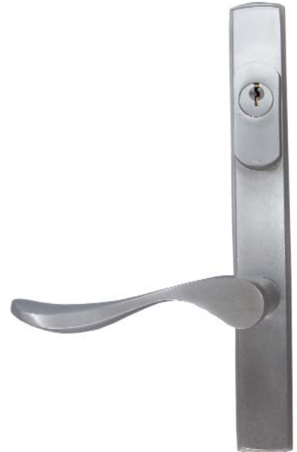
Venice - Keyed Deadbolt