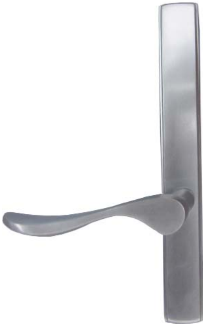
Venice - Passage Only