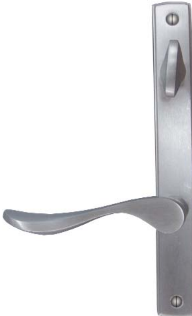
Venice - Thumb Turn Deadbolt