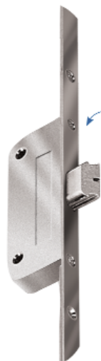
The Eagle Automatic Latch

As the fenestration industry's leading innovator, G-U prides itself on quality hardware, knowledgeable technical assistance and the most reliable customer service.