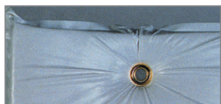
Mounting Type "A" Slight puckering on Fabric Face