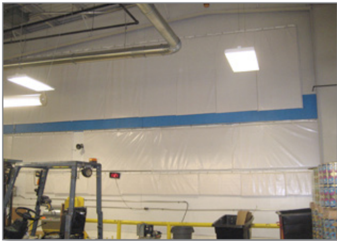
SANITARY ACOUSTICAL BAFFLES

Fiberglass sound baffles reduce the reflection of sound waves by adding soft, non-porous to an environment. The Sanitary Acoustical Baffle is durable, low cost and virtually rip-proof. The sound absorption core is completely encapsulated in reinforced mylar film. The white facing reflects light, which adds to the illumination in a room. These sound baffles are constructed with all edges bound, and grommets across the top.